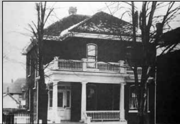
CARON HOUSE SHELTER, 1913