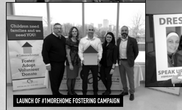
LAUNCH OF #1MOREHOME FOSTERING CAMPAIGN