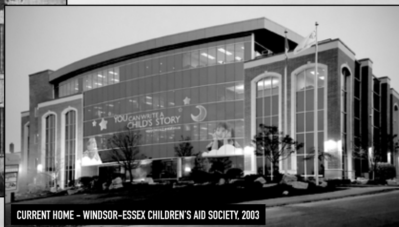
CURRENT HOME - WINDSOR-ESSEX CHILDREN'S AID SOCIETY, 2003