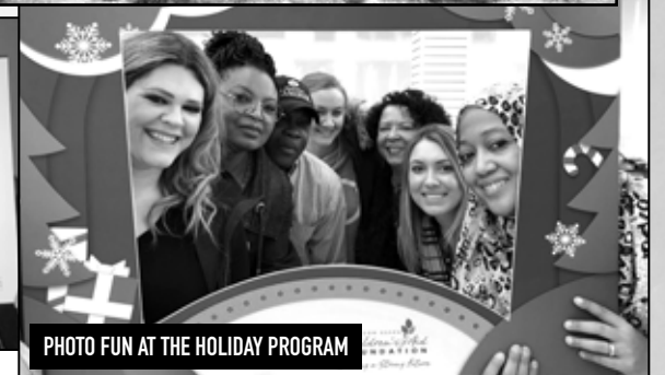
PHOTO FUN AT THE HOLIDAY PROGRAM