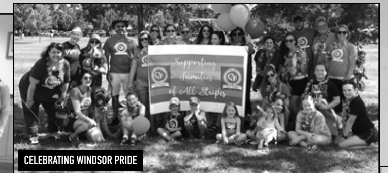
CELEBRATING WINDSOR PRIDE