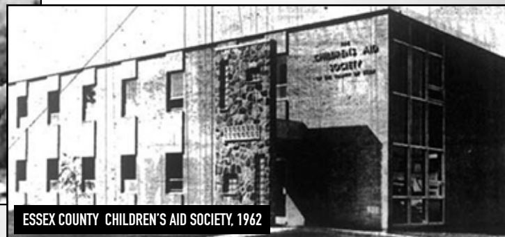
ESSEX COUNTY CHILDREN'S AID SOCIETY, 1962