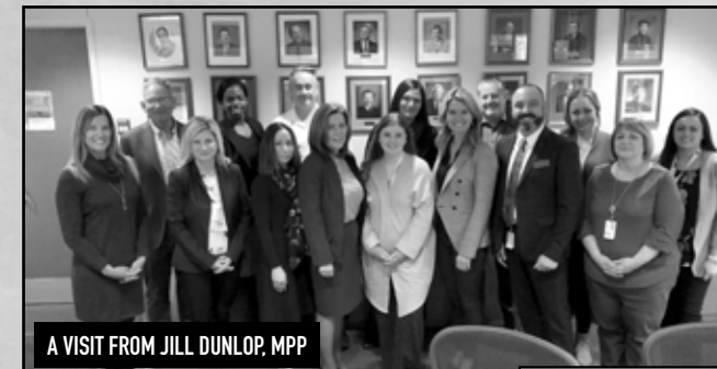
A VISIT FROM JILL DUNLOP, MPP