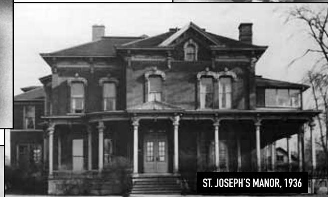
ST. JOSEPH'S MANOR, 1936