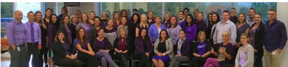
Photo credits: Top Row (l-r): Regional Children's Centre & Ska:na Family Learning Centre. Row 2 (l-r): John McGivney Children's Centre. Row 3 (l-r): St. Thomas of Villanova Catholic High, Windsor Women Working with Immigrant Women & Maxwell David Public School. Bottom Row: Windsor Essex Children's Aid Society